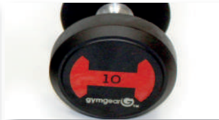
Easy Weight Identification