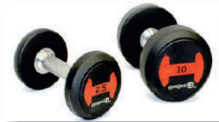
Rubber & Steel