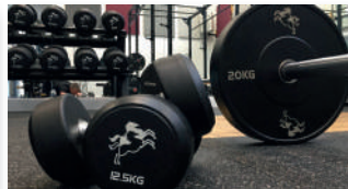
Custom Branding Available